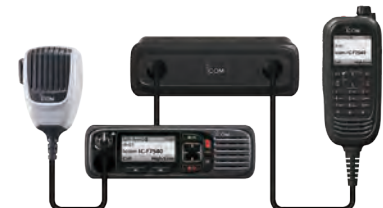
COMMANDMIC™ and Detached Controller Optional RMK-5, COMMANDMIC, HM-218 and separation cables required.

Icom, Icom Inc. and the Icom logo are registered trademarks of Icom Incorporated (Japan) in Japan, the United States, the United Kingdom, Germany, France, Spain, Russia, Australia, New Zealand and/or other countries. COMMANDMIC is a trademark of Icom Incorporated. The Bluetooth® word mark and logos are registered trademarks owned by Bluetooth SIG, Inc. and any use of such marks by Icom Inc. is under license. AMBE+2 is a trademark and property of Digital Voice Systems, Inc. 3M, Peltor, and WS are trademarks of 3M Company. All other trademarks are the properties of their respective holders.