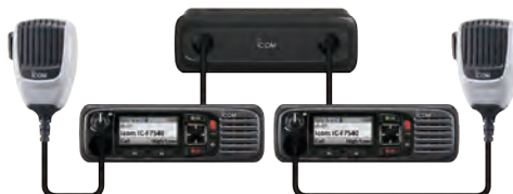
Dual Head Controller Optional RMK-7, hand microphone and separation cables required.