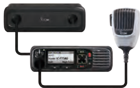
Detached Controller Optional RMK-5 and separation cable required.

Some options may not be available in some countries. Please ask your dealer for details.